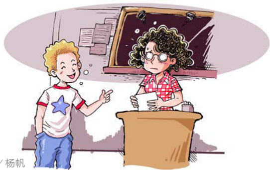
插图 / 杨帆

上对外汉语课，老师提问：“同学们，你们每人说一个汉语成语，形容老师今天很开心很高兴的样子。”学生很活跃：“眉开眼笑”、“开怀大笑”、“兴高采烈”……老师接着说：“说出来的成语里要含有数字，比如一、二、三、四……”一位美国留学生反应很快，大声抢答：“老师，含笑九泉！”