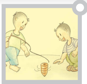
滚铁环 ROLLING IRON HOOP