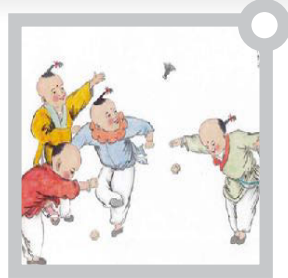
放风筝 FLYING KITE